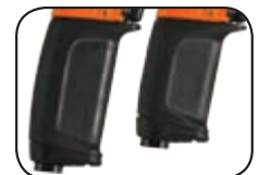
* Small Handle: Order Part Number 207595PT