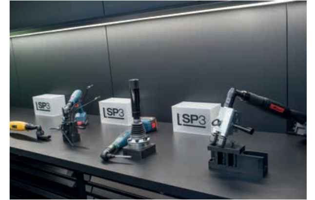
Practical fastening stations to try out.