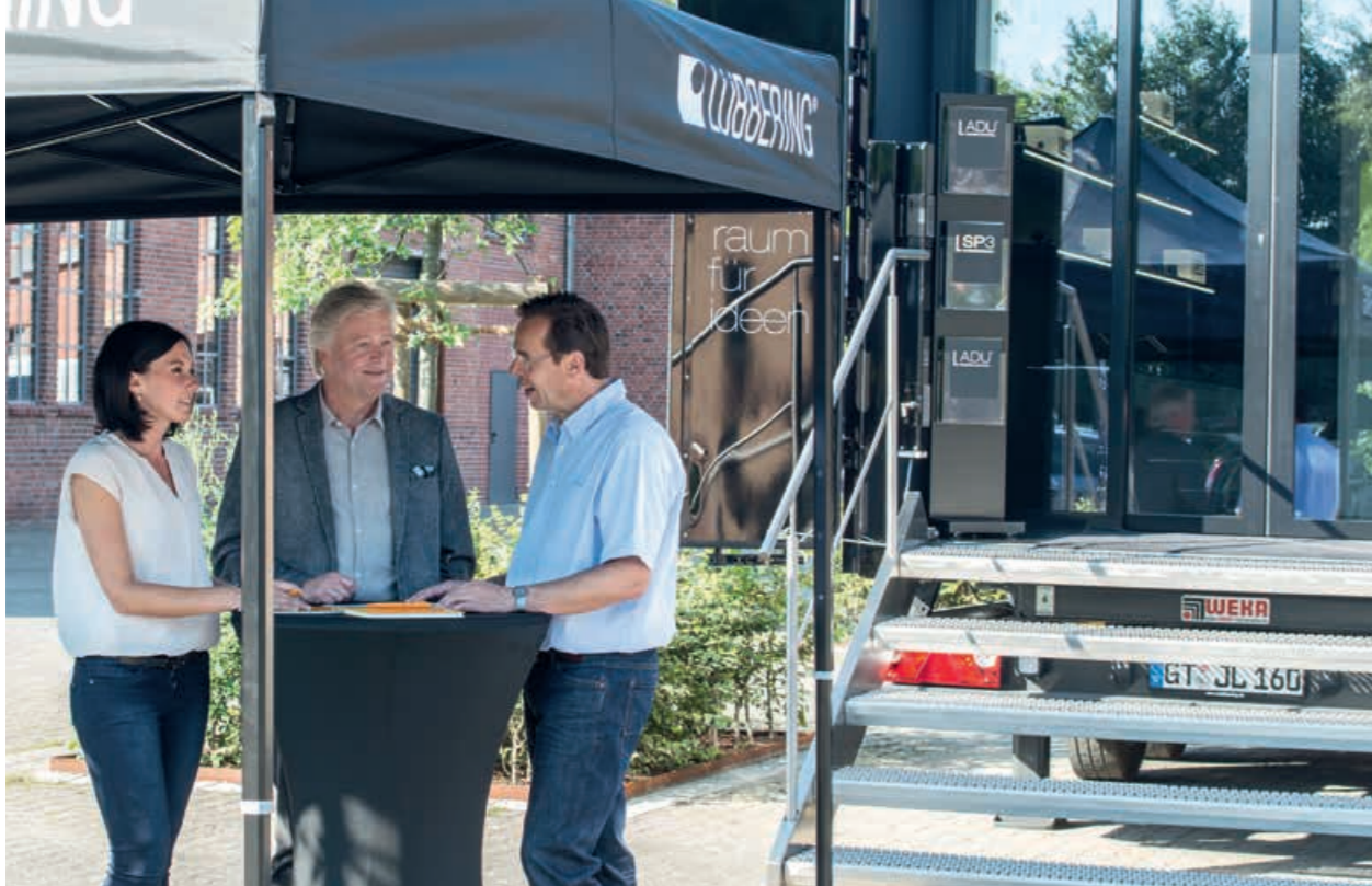
The ultimate in individuality: The raum für ideen is there for you all day long.