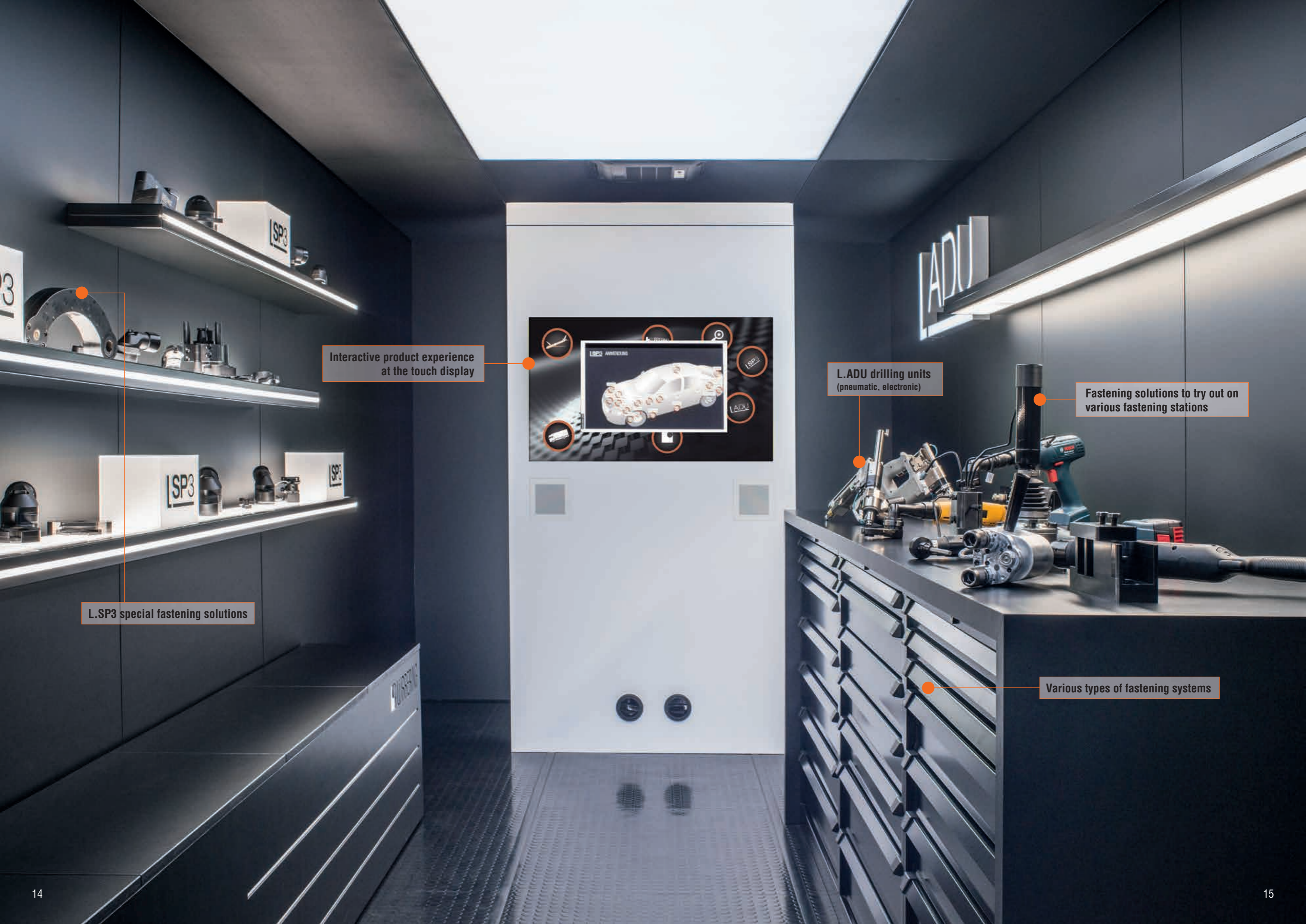
Interactive product experience at the touch display