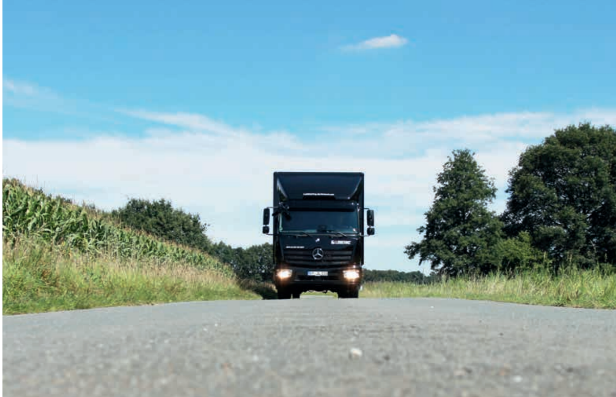
From the idea onto the road: The LÜBBERING ShowTruck is ready for the tour.